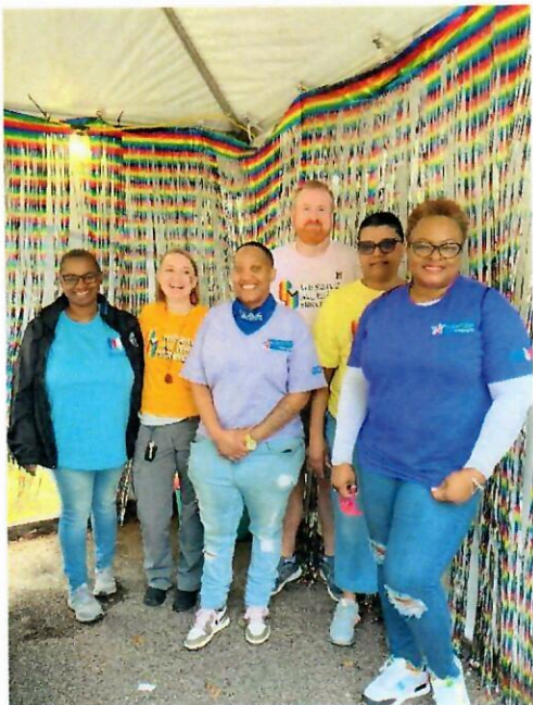
GDVS & VA