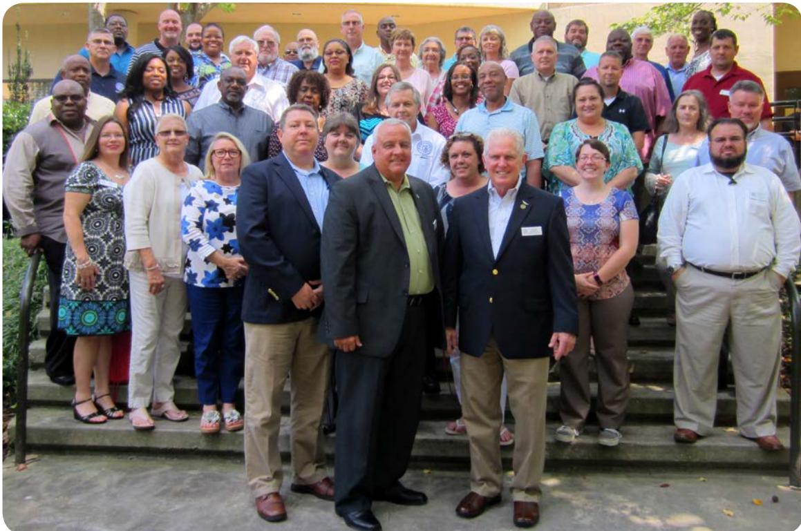
North Region Veterans Field Service Officers