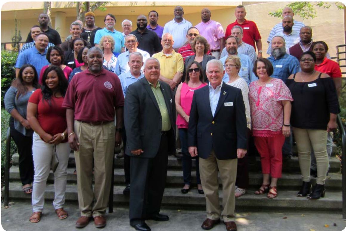
South Region Veterans Field Service Officers